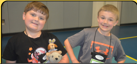
Fun at Camp!

Click here for email request that you can Copy and Paste.